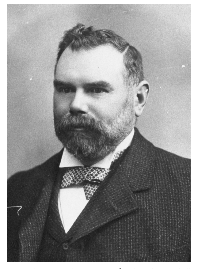
Fig. 5 Thomas Mackenzie, c. 1903<sup>5</sup> (Alexander Turnbull Library, General Assembly Library Collection [PAColl-0838], 35mm-00171-A; F; reproduced with permission).

The Animals Protection Act was passed on 25 November 1907, six days after the Executive Titles Act, after which Members of the House of Representatives became Members of Parliament, and the Colonial Secretary's Office became the Department of Internal Affairs (Bassett 1997).