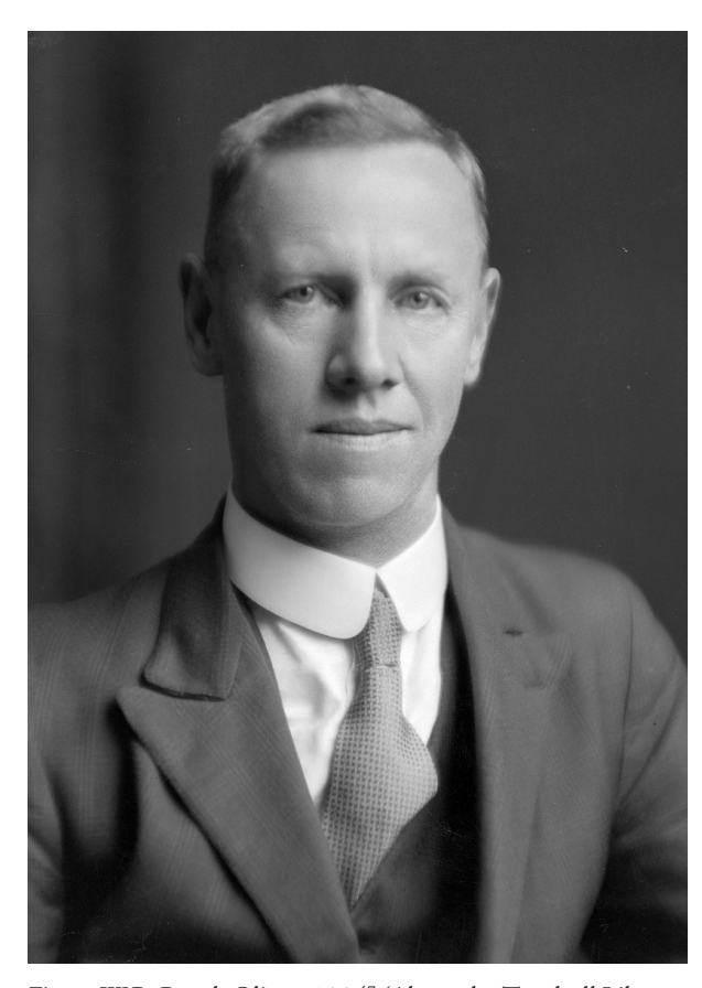
Fig. 7 W.R. Brook Oliver, 1934<sup>7</sup> (Alexander Turnbull Library, S.P. Andrew collection [PAColl-3739], 1/1-018168; F; reproduced with permission).

According to my views there are two species of kaka in New Zealand and only one appears in the list. Although any argument that the Act as it now stands only applies to the green kaka could not be upheld it would be safer to have the name adopted in my book [i.e. Oliver 1930] for the brown or North Island species gazetted. (IA 25/28/5 Part 3)