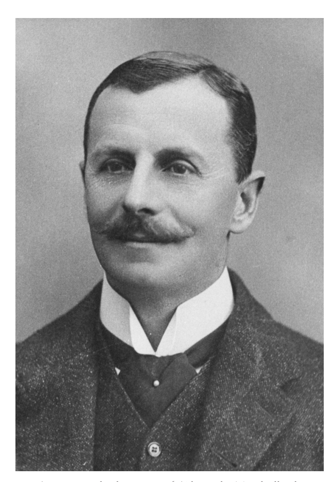
Fig. 6 Heaton Rhodes, c. 1901<sup>6</sup> (Alexander Turnbull Library, General Assembly Library Collection [PAColl-0838], 35mm-00171-F; F; reproduced with permission).

The concept of protecting all native birds, then making certain exceptions (i.e. Section 10.1 of the Animals Protection Amendment Act 1910), was proposed by Heaton