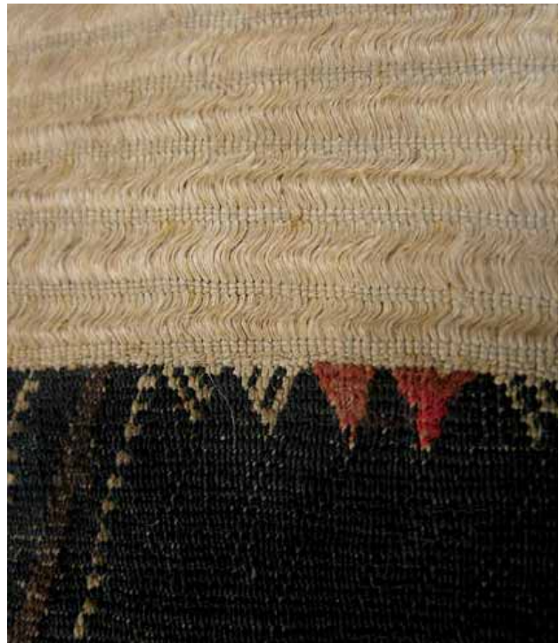
An example of woven fibre. Whatu aho rua (double pair twining) and top edge of tāniko (border) on traditional kaitaka (cloak).