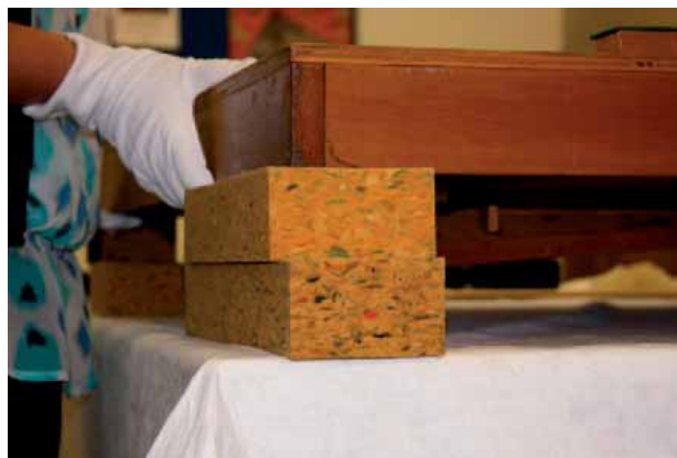
Padded or foam blocks provide a cushioned support for frames and paintings; they can also be used to protect a painting resting horizontally on a table.

When labelling, write in pencil on a separate piece of paper that is large enough to fold around the whole photograph. Always avoid sticky tape or paper clips – even for temporary labels.