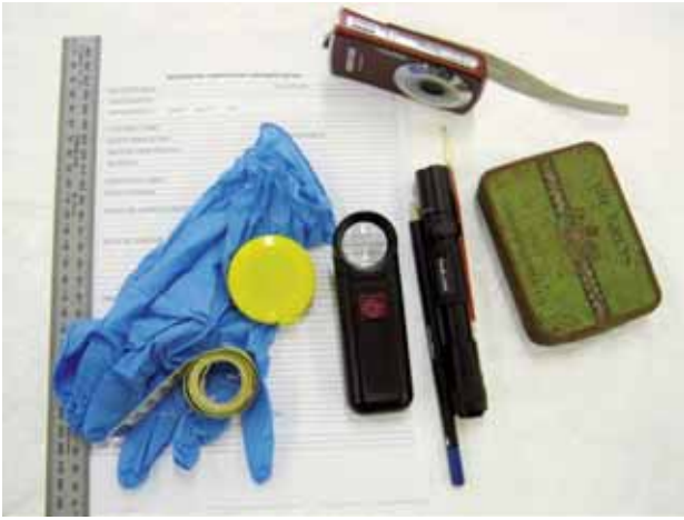
Equipment for condition reporting: camera, brush, object, torch, pencil, magnifier, pull-out measuring tape, cloth measuring tape, gloves, ruler and condition report form.