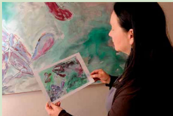
Photographic overlays can simplify a complicated job of descriptive writing, for example, in the case of a painting with numerous damages.