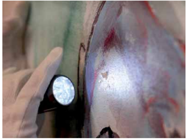
Raking light accentuates any relief or surface deformation.