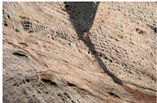
An example of beaten inner bark fibre, generally known as tapa cloth.