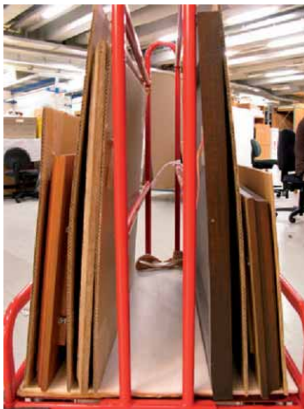
Paintings should be stacked parallel to each other with corrugated card placed between the paintings for protection.