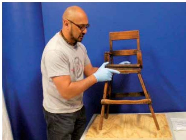
Lift chairs at their strongest point using both hands and wearing gloves.

Wear cotton or surgical gloves if you need to touch the upholstered parts of furniture.